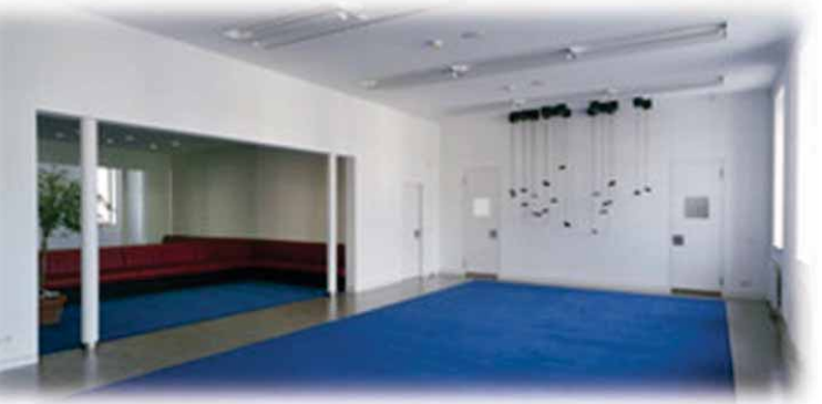
The seminar venue: Lounge, the Art and Exhibition Hall

Catering will be served for further exchange of views among the participants after the event.