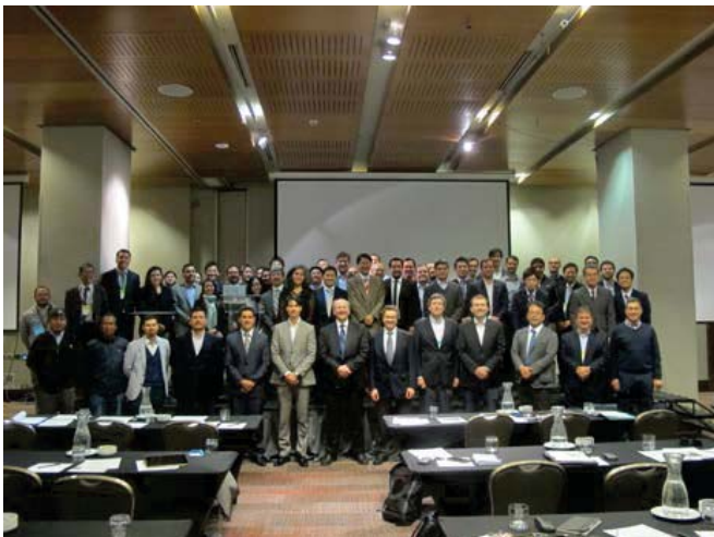
JCM Seminar and business matching in Chile in August 2019